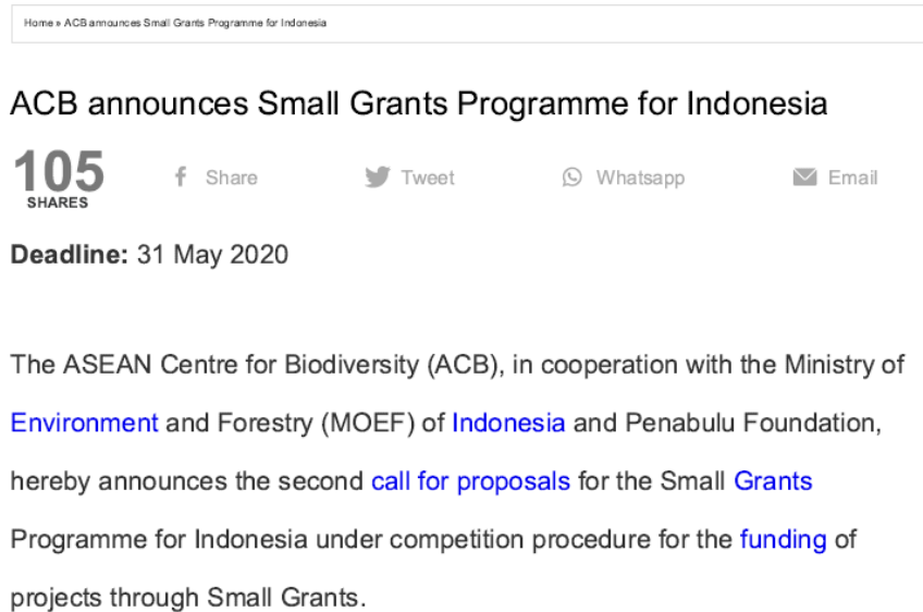
Picture 6. Visibility on NGO for Funds Mailinglist

As a result of information dissemination from various media, SP received a total of 32 proposals with details of 19 proposals for TNGL and 13 proposals for TNWK. The table below shows the proponents who submitted the Call for Proposal SGP Indonesia Cycle 2.