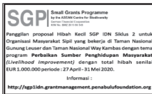
Picture 2. PSA Visibility in Media Indonesia Daily

SP also uses national mass media to maximize the dissemination of information on SGP Indonesia Cycle 2 small grants. Screening of national media uses Media Indonesia and airs on Saturday, April 25, 2020.