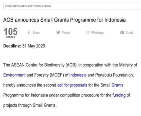
Picture 5. PSA in Devjobs Mailinglist