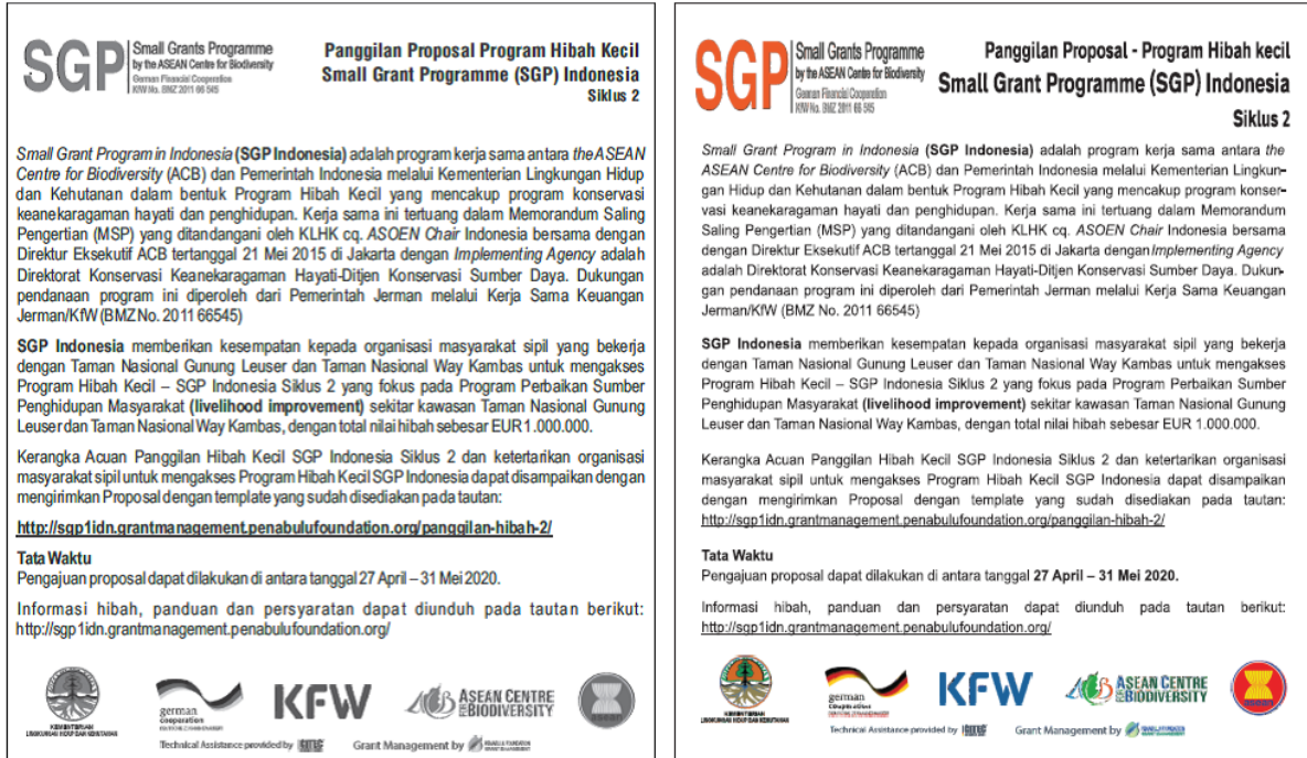
Picture 1. PSA visibility in Lampung Post Daily and Tribunews Daily

Dissemination of information for North Sumatra proponent candidates using Medan Tribunews Daily. The airing of Public Service Advertising (PSA) related to the call for the SGP Indonesia Cycle 2 small grant proposal was conducted on April 25, 2020.